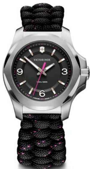
241918 - I.N.O.X.V ø 37 mm