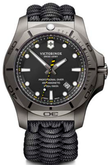
241812 - I.N.O.X PROFESSIONAL DIVER TITANIUM Ø 45 mm