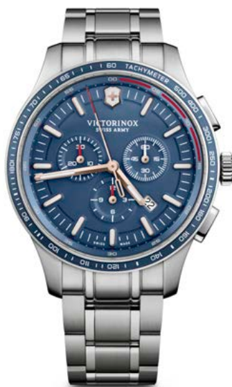
241817 - ALLIANCE SPORT CHRONO ø 40 mm