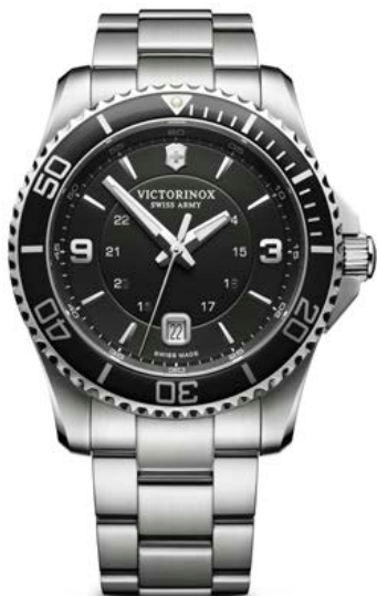
241697 - MAVERICK ø 43 mm