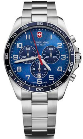
241901 - FIELDFORCE CLASSIC CHRONO ø 42 mm