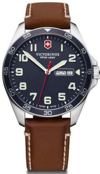
241848 - FIELDFORCE Ø 42 mm