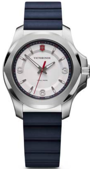
241919 - I.N.O.X.V Ø 37 mm