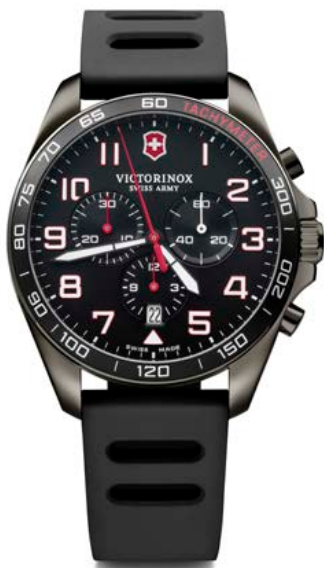
241889 * - FIELDFORCE SPORT CHRONO Ø 42 mm