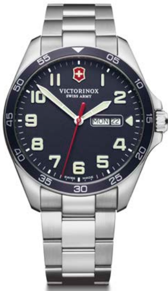
241851 - FIELDFORCE Ø 42 mm