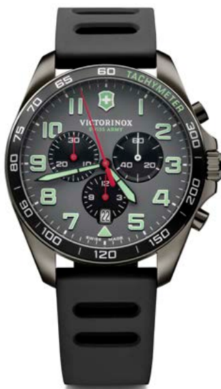
241891 * - FIELDFORCE SPORT CHRONO Ø 42 mm