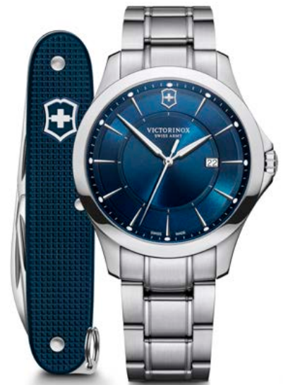
241910.1 * / 1 - ALLIANCE ø 40 mm