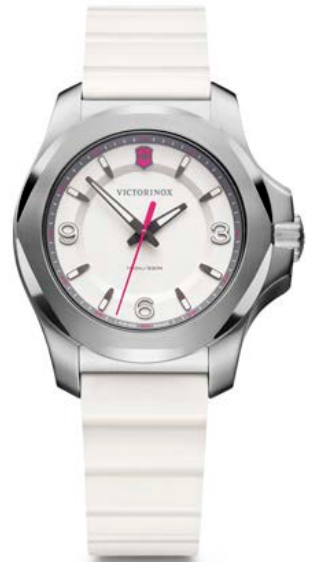
241921 - I.N.O.X.V Ø 37 mm