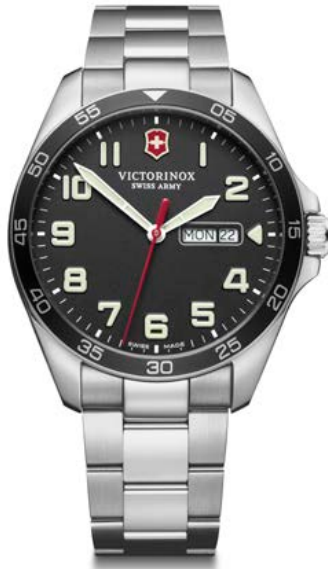
241849 - FIELDFORCE Ø 42 mm