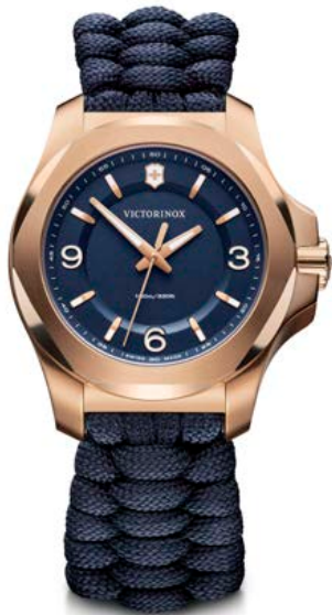
241955 * - I.N.O.X.V ø 37 mm