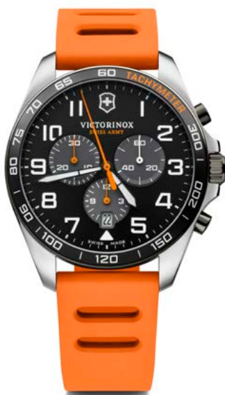
241893 1 - FIELDFORCE SPORT CHRONO Ø 42 mm