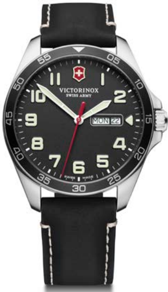
241846 - FIELDFORCE Ø 42 mm