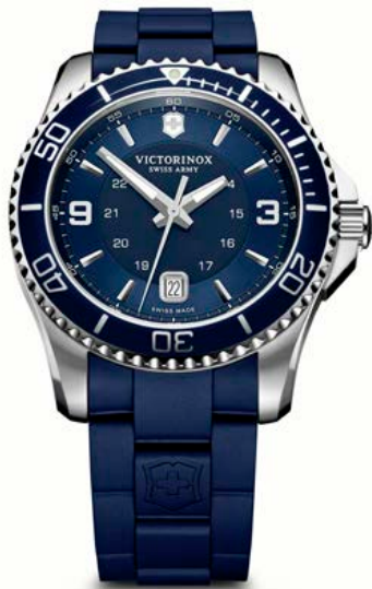
241603 - MAVERICK ø 43 mm