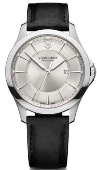
241905 1 - ALLIANCE ø 40 mm