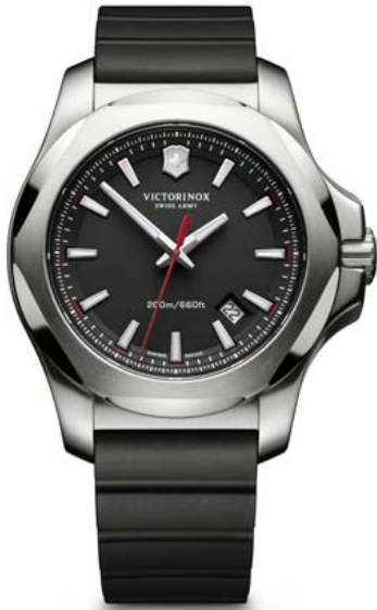
241682 - I.N.O.X. Ø 43 mm