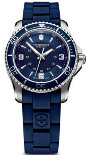
241610 - MAVERICK SMALL ø 34 mm