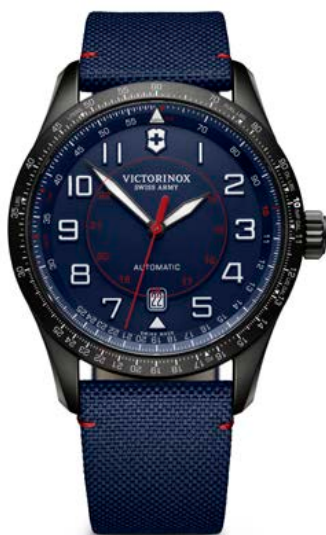
241820 * - AIRBOSS MECHANICAL ø 42 mm