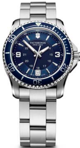
241609 - MAVERICK SMALL ø 34 mm