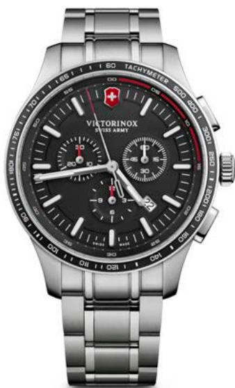
241816 - ALLIANCE SPORT CHRONO ø 40 mm