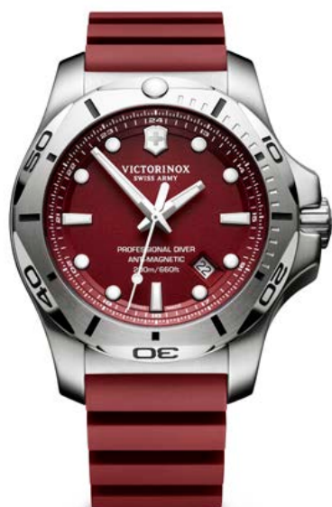
241736 - I.N.O.X PROFESSIONAL DIVER Ø 45 mm