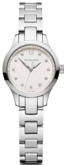
241875 ** - ALLIANCE XS ø 28 mm