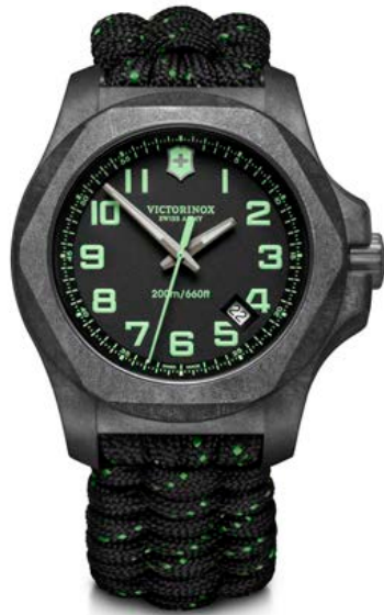
241859 - I.N.O.X CARBON Ø 43 mm