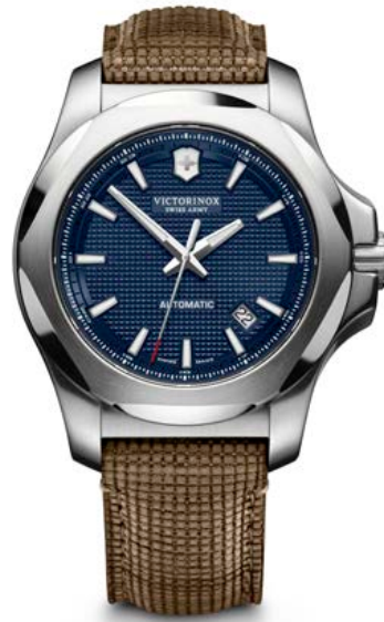
241834 - I.N.O.X MECHANICAL Ø 43 mm