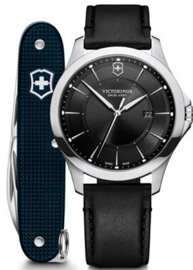
241904.1 * / 1 - ALLIANCE ø 40 mm