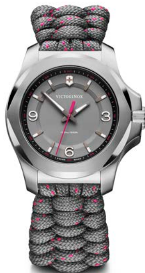
241920 - I.N.O.X.V ø 37 mm