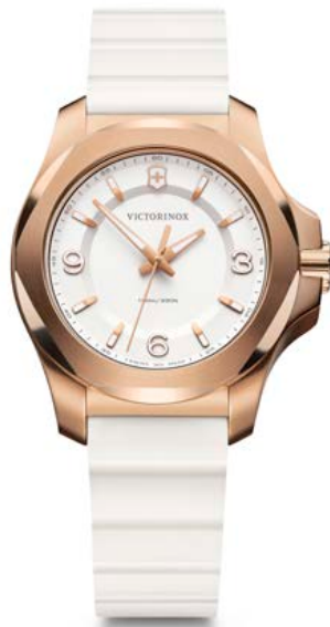
241954 * - I.N.O.X.V ø 37 mm