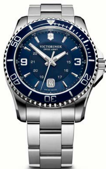
241602 - MAVERICK ø 43 mm