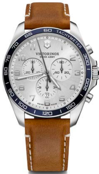
241900 - FIELDFORCE CLASSIC CHRONO ø 42 mm