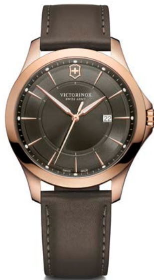
241908 ** - ALLIANCE ø 40 mm