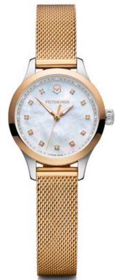
241879 */** - ALLIANCE XS ø 28 mm