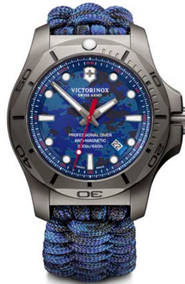
241813 - I.N.O.X PROFESSIONAL DIVER TITANIUM Ø 45 mm