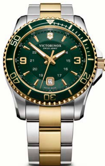
241605* - MAVERICK ø 43 mm