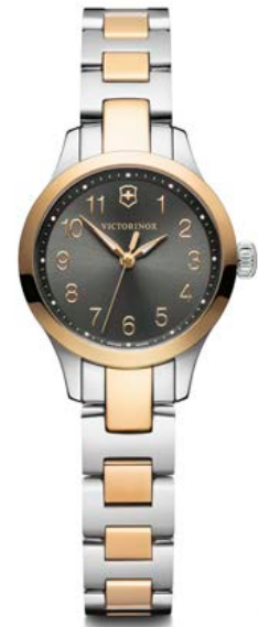
241841 * - ALLIANCE XS ø 28 mm