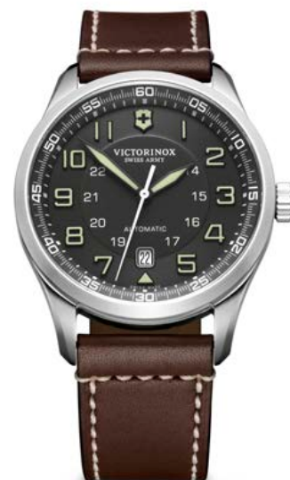
241507 - AIRBOSS MECHANICAL ø 42 mm