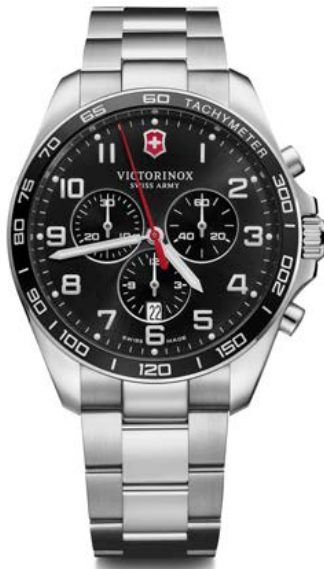
241899 - FIELDFORCE CLASSIC CHRONO ø 42 mm