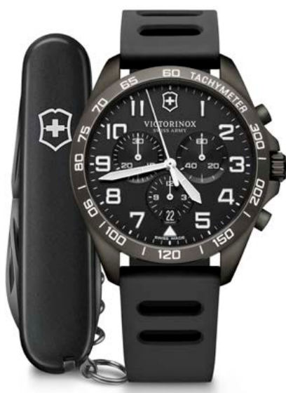
241926.1 **/ - FIELDFORCE SPORT CHRONO Ø 42 mm