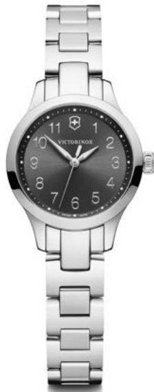
241839 - ALLIANCE XS ø 28 mm