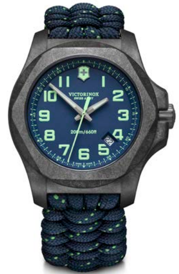
241860 - I.N.O.X CARBON Ø 43 mm